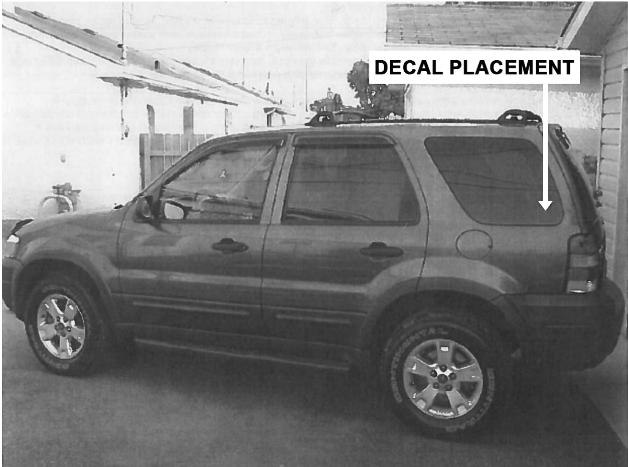
Figure 2: Proper placement of decal on a utility vehicle