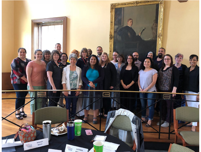
Incoming and outgoing Staff Council members at the "crossover meeting" in June 2018.