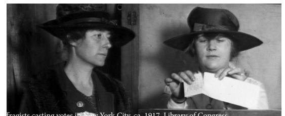
Fragists casting votes in New York City, ca. 1917

Membership and Recruitment has set up a new link for nominations. To nominate someone, go to the Staff Council website and click: "submit your name here" and fill out the form. Nominations will be accepted through the middle of March.