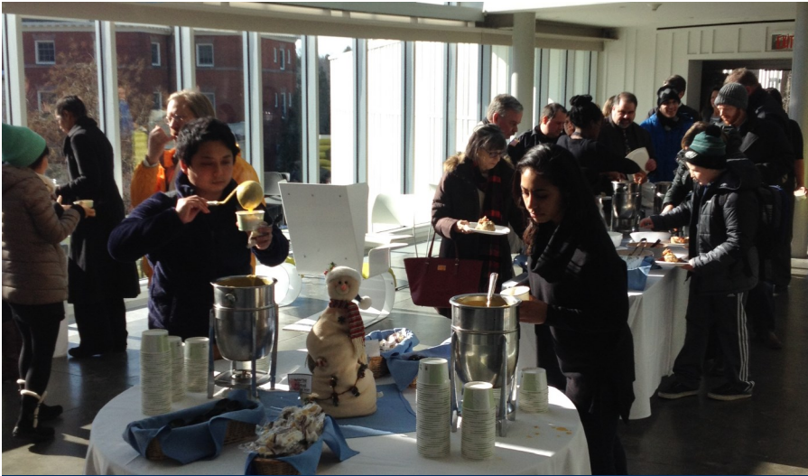
Staff Council and Faculty Council co-hosted their annual Soup and Spuds event on Wednesday, January 20, 2016.