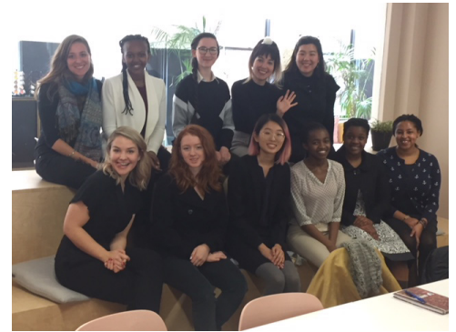
The Smith students with members of Small Girls PR