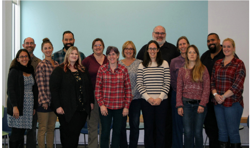
Staff Council, October 2019.

I don't think it's possible for me to thank everyone who has worked so hard making the massive transition to the remote work environment we are dealing with now. I also don't want to forget those who are still working on campus.